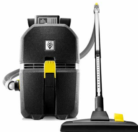
BVL 5/1 BP