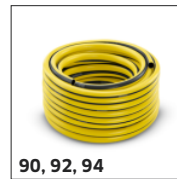
90, 92, 94