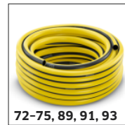
72-75, 89, 91, 93